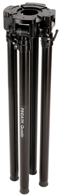
Quado 4-Leg Mitchell Camera Tripod Stand

Please inspect the contents of your shipped package to ensure you have received everything that is listed below.