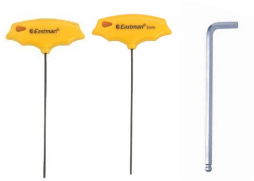
3 x 2.5mm, 3mm, 5/16" Allen keys