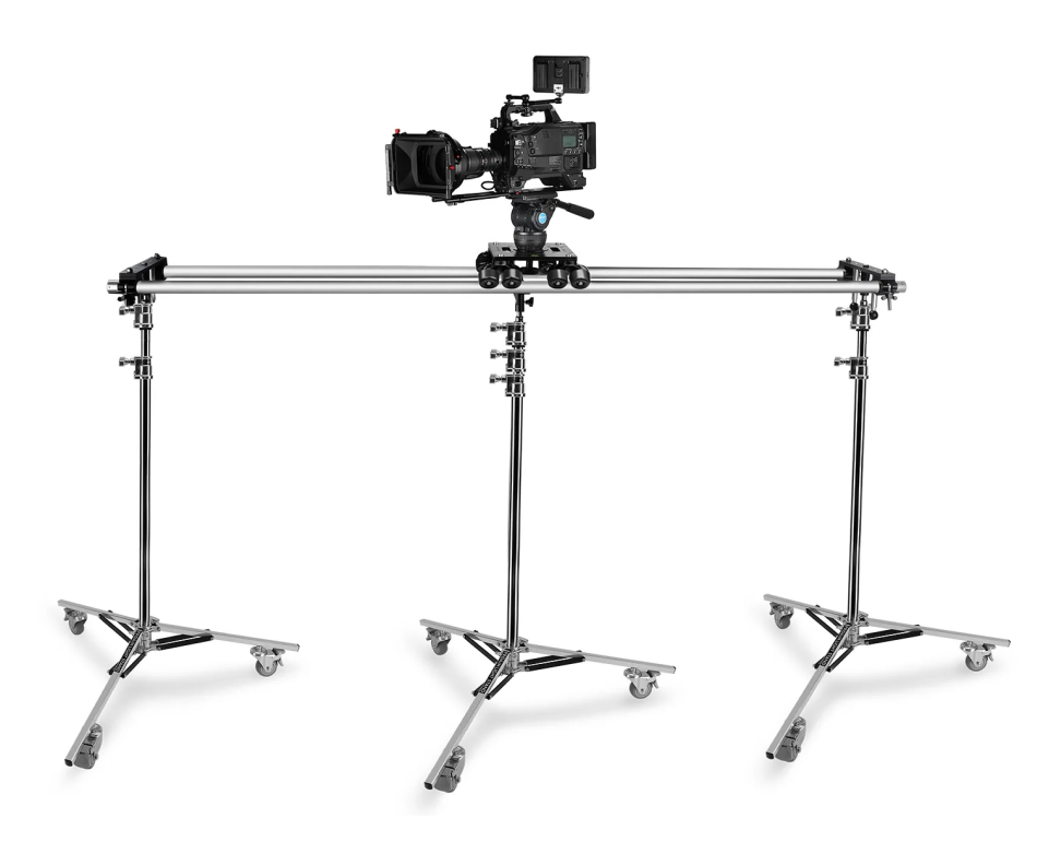
(SHOWN WITH OPTIONAL ACCESSORIES)

Warranty: We offer one year warranty for our products from date of purchase. Within this period of time, we will repair it without charge for labor or parts. Warranty doesn't cover transportation costs nor does it cover a product subjected to misuse or accidental damage. Warranty repairs are subjected to inspection and evaluation by us.