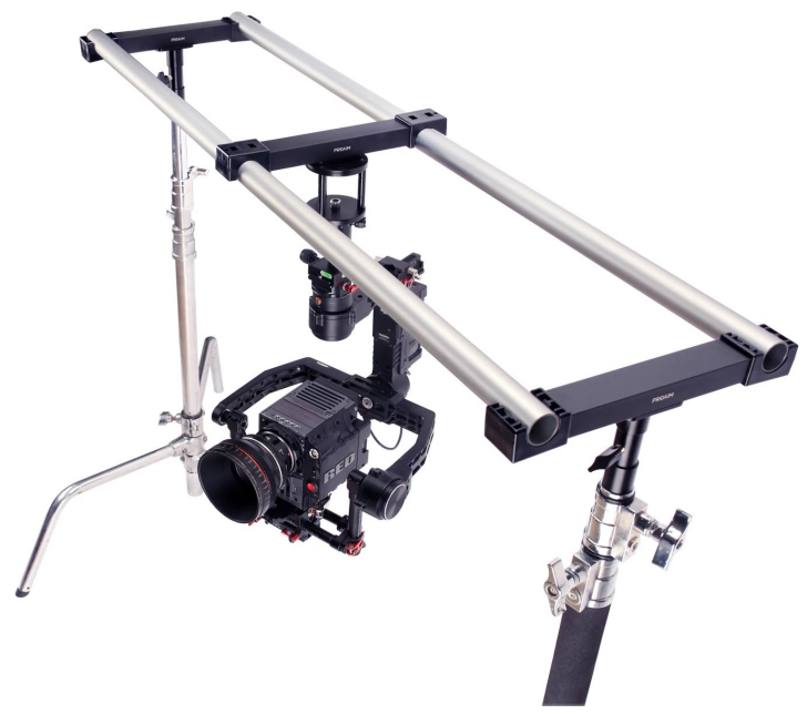
(SHOWN WITH OPTIONAL ACCESSORIES)

Warranty: We offer one year warranty for our products from date of purchase. Within this period of time, we will repair it without charge for labor or parts. Warranty doesn't cover transportation costs nor does it cover a product subjected to misuse or accidental damage. Warranty repairs are subjected to inspection and evaluation by us.