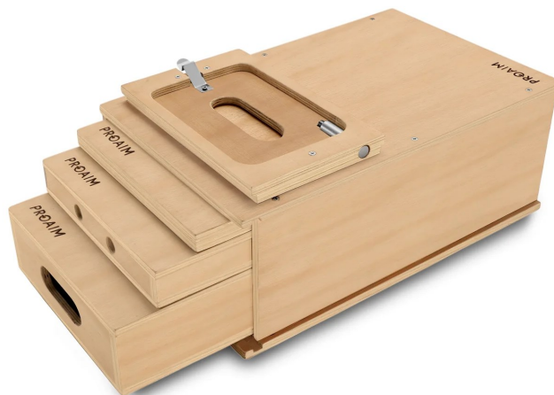
Full, Half, Quarter, Pancake Sized Apple Box

Please inspect the contents of your shipped package to ensure you have received everything that is listed below.