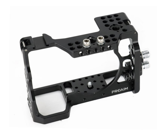
Muffle Cage for Sony A7RIII Camera

Please inspect the contents of your shipped package to ensure you have received everything that is listed below.