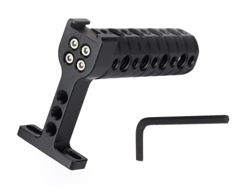
Top Handle with Allen Key