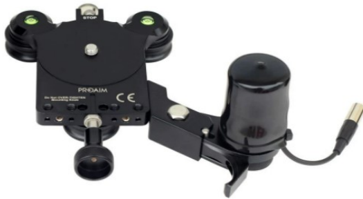
Camera Plate with Motor

Please inspect the contents of your shipped package to ensure you have received everything that is listed below.