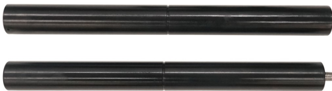
2 x Rods (Length 40cm each)

Please inspect the contents of your shipped package to ensure you have received everything that is listed below.