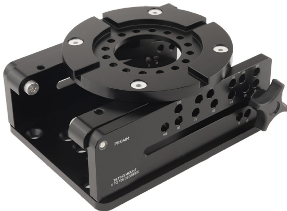
Mitchell Wedge Tilt Camera Mount

Please inspect the contents of your shipped package to ensure you have received everything that is listed below.