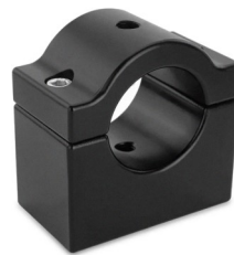
1 x 48.3mm Rod Clamp