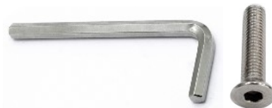
1 x (5mm) Allen Keys 1 x Allen Bolt (35mm)