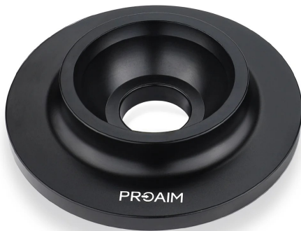
Proaim Mitchell Base to Bowl Camera Adapter 100mm

Please inspect the contents of your shipped package to ensure you have received everything that is listed below.