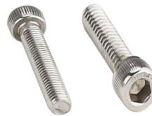
2 x Bolts