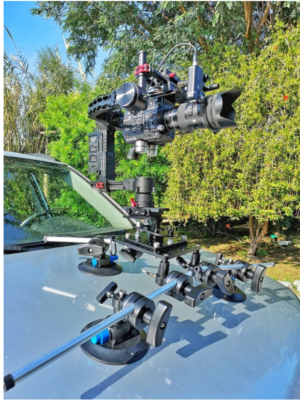
(SHOWN WITH OPTIONAL ACCESSORIES)

Warranty: We offer one year warranty for our products from date of purchase. Within this period of time, we will repair it without charge for labor or parts. Warranty doesn't cover transportation costs nor does it cover a product subjected to misuse or accidental damage. Warranty repairs are subjected to inspection and evaluation by us.