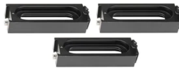
3 x Legs