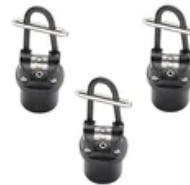
3 x Spike Feet