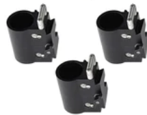
3 x Adapters