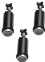
3 x Feet With Knobs