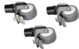
3 x Caster Wheels