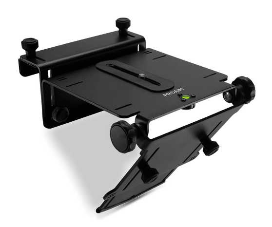
Proaim Keen-Eye Car Mount

Please inspect the contents of your shipped package to ensure you have received everything that is listed below.