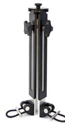
Aluminum Tripod Spreader