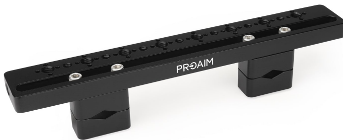
Proaim Headrest Car Mount

Please inspect the contents of your shipped package to ensure you have received everything that is listed below.