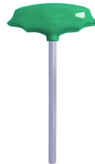
1 x Allen Key 3/16mm