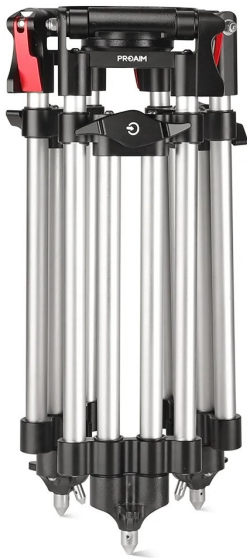
HD 150mm Bowl Baby Camera Tripod Stand with Lever Friction

Please inspect the contents of your shipped package to ensure you have received everything that is listed below.