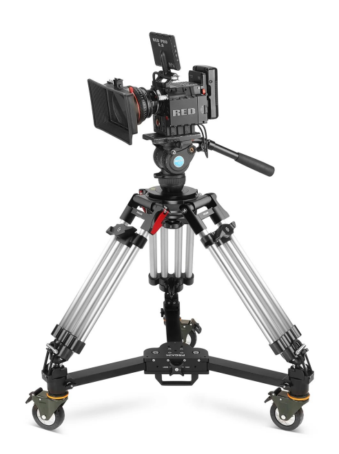
(SHOWN WITH OPTIONAL ACCESSORIES)

Warranty: We offer one year warranty for our products from date of purchase. Within this period of time, we will repair it without charge for labor or parts. Warranty doesn't cover transportation costs nor does it cover a product subjected to misuse or accidental damage. Warranty repairs are subjected to inspection and evaluation by us.