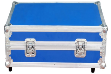
Flight Transport Case