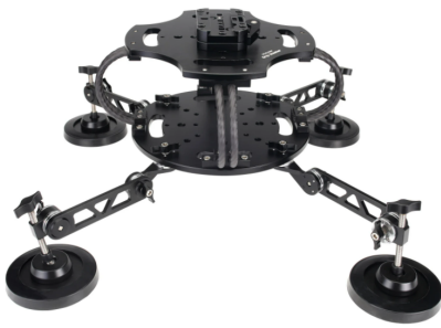
Gimbal Vibration Isolator

NOTE: If you have purchased (CM-GMST-01) kit, you will receive the following: