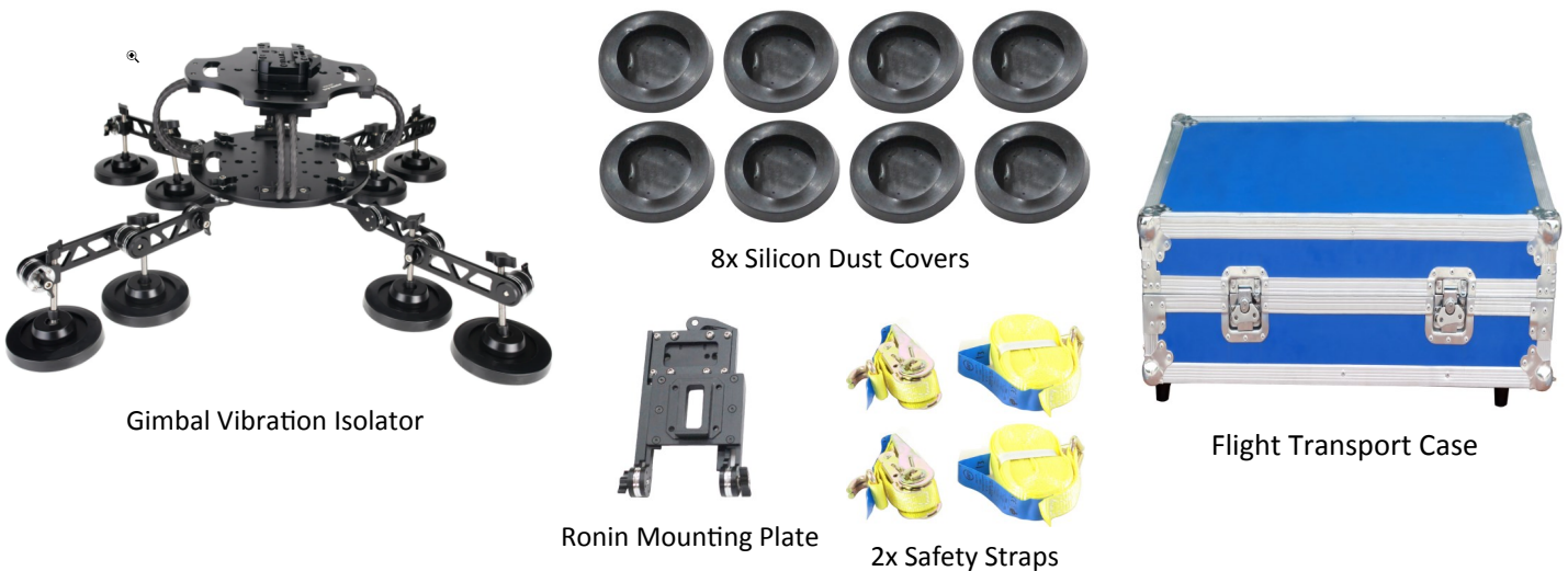
Gimbal Vibration Isolator

NOTE: If you have purchased (CM-GMST-00) kit, you will receive the following: