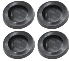
4x Silicon Dust Covers