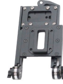
Ronin Mounting Plate