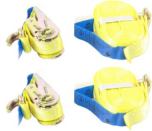
2x Safety Straps