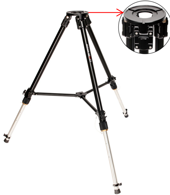
Proaim Gravity Professional Video Tripod Mitchell

Note: If you have purchased (TP-GVTY-02) kit, you will receive the following: