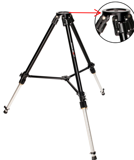
Proaim Gravity Professional Video Tripod Stand Flat

Note: If you have purchased (TP-GVTY-01) kit, you will receive the following. The assembly point will remain the same in both stands.