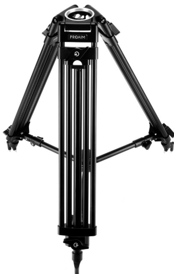
Proaim Gravita 75mm Dual Stage Tripod

Please inspect the contents of your shipped package to ensure you have received everything that is listed below.