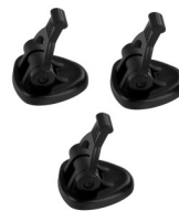
3 x Feet