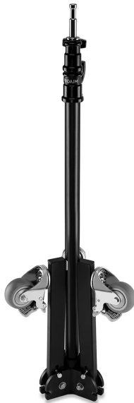
Proaim 5/8" Folding Wheel Base Stand

Please inspect the contents of your shipped package to ensure you have received everything that is listed below.