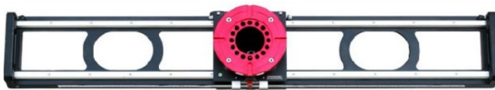
Flying Mitchell Mount Camera Slider

Please inspect the contents of your shipped package to ensure you have received everything that is listed below.