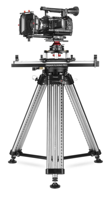
(SHOWN WITH OPTIONAL ACCESSORIES)

Warranty: We offer one year warranty for our products from date of purchase. Within this period of time, we will repair it without charge for labor or parts. Warranty doesn't cover transportation costs nor does it cover a product subjected to misuse or accidental damage. Warranty repairs are subjected to inspection and evaluation by us.