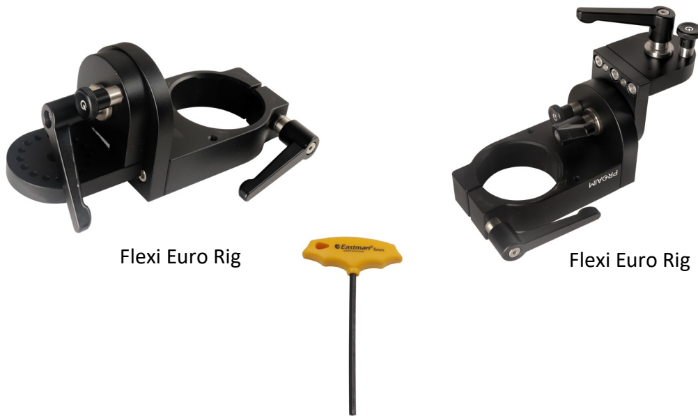
Flexi Euro Rig

Please inspect the contents of your shipped package to ensure you have received everything that is listed below.