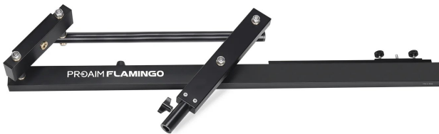
Flamingo Light Boom

Please inspect the contents of your shipped package to ensure you have received everything that is listed below.