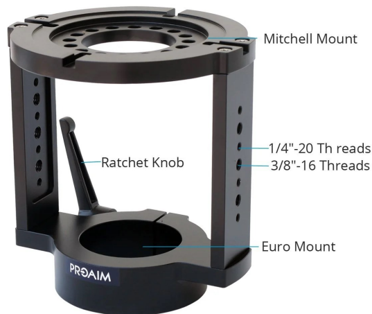
Proaim Euro/Elemac to Mitchell Riser Adapter

Please inspect the contents of your shipped package to ensure you have received everything that is listed below.