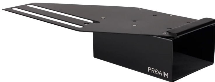
Proaim EDC for Laptop Workstation

Please inspect the contents of your shipped package to ensure you have received everything that is listed below.