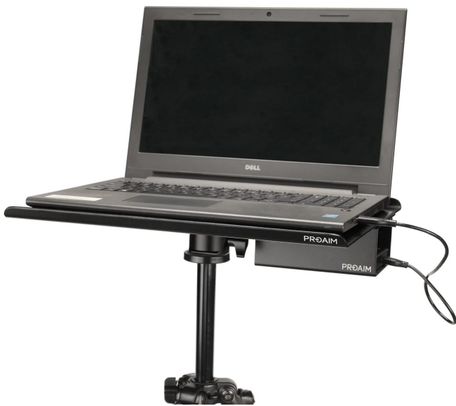
(SHOWN WITH OPTIONAL ACCESSORIES)