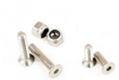
2 x (1/4" x 1 1/4") Mounting Screws 2 x (1/4" x 3/4") Screws