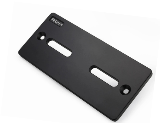
Proaim Dovetail Mount Base Plate

Please inspect the contents of your shipped package to ensure you have received everything that is listed below.