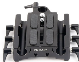
Top Quick Release Camera Mount