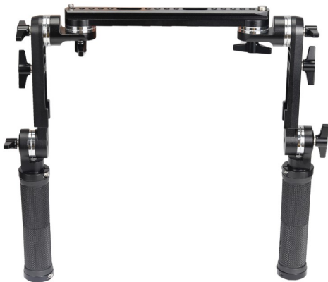
Front Handle Set

Please inspect the contents of your shipped package to ensure you have received everything that is listed below.