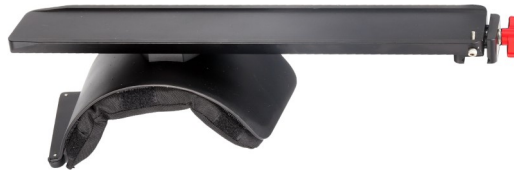
Shoulder plate with Shoulder Pad