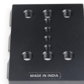
Lower Quick Dovetail Tripod Plate