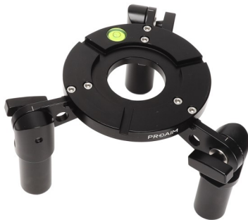
Cyrus Pro Hi-Hat Mitchell

Please inspect the contents of your shipped package to ensure you have received everything that is listed below.