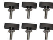
6 x Ratchet Knobs