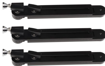
3 x Telescopic Legs