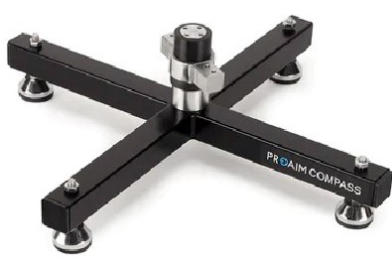
Dolly Base Leg

Please inspect the contents of your shipped package to ensure you have received everything that is listed below.