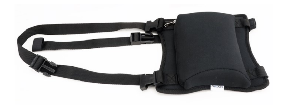
Proaim Comfy Standard Shoulder Pad

Please inspect the contents of your shipped package to ensure you have received everything that is listed below.