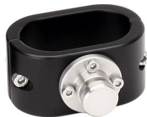
Support Bar Clamp