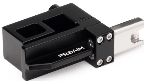
Cart Docking Bracket

Please inspect the contents of your shipped package to ensure you have received everything that is listed below.