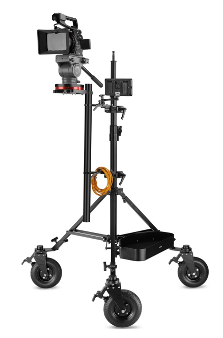
(SHOWN WITH OPTIONAL ACCESSORIES)

Warranty: We offer one year warranty for our products from date of purchase. Within this period of time, we will repair it without charge for labor or parts. Warranty doesn't cover transportation costs nor does it cover a product subjected to misuse or accidental damage. Warranty repairs are subjected to inspection and evaluation by us.