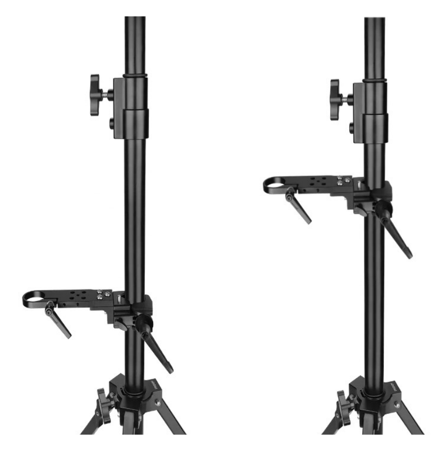
Camera Mount Clamps 360° Rotation