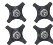
4 X Knobs