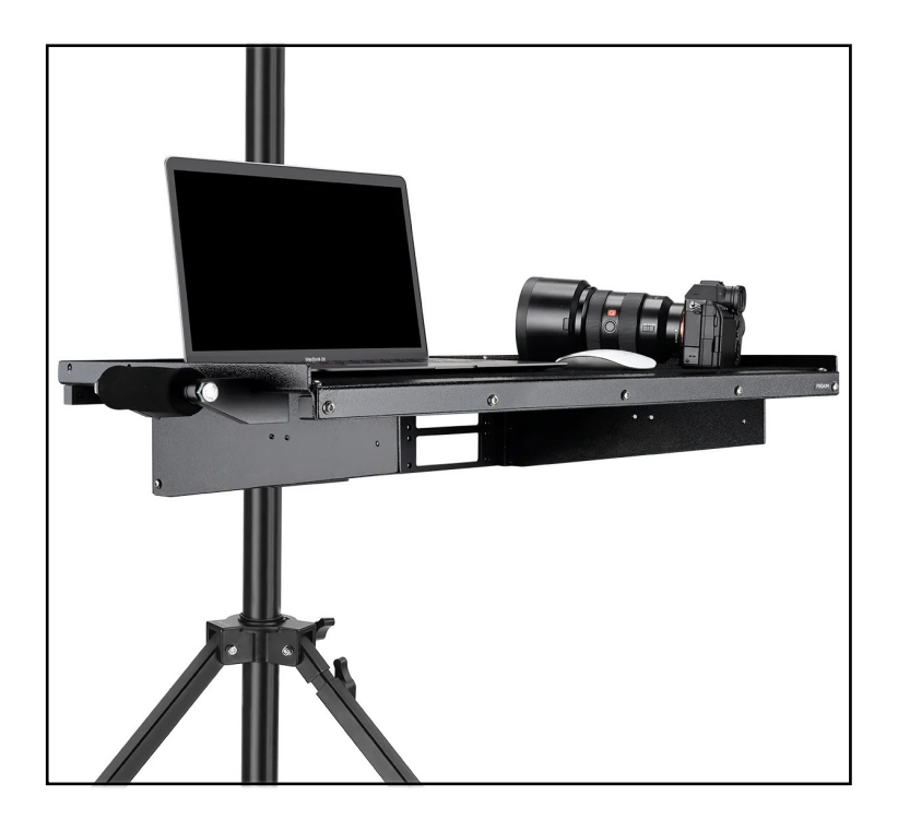
(SHOWN WITH OPTIONAL ACCESSORIES)

Warranty: We offer one year warranty for our products from date of purchase. Within this period of time, we will repair it without charge for labor or parts. Warranty doesn't cover transportation costs nor does it cover a product subjected to misuse or accidental damage. Warranty repairs are subjected to inspection and evaluation by us.