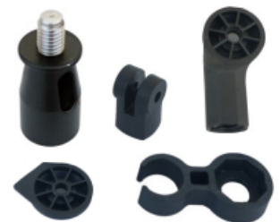
Bonus 6 pc. Boom Pole Adapter Set