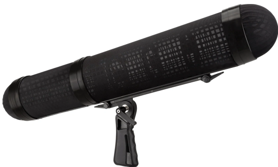
60cm Blimp Windscreen with Microphone Suspension and Handle

Please inspect the contents of your shipped package to ensure you have received everything that is listed below.