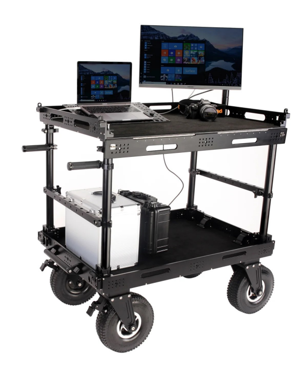
(SHOWN WITH OPTIONAL ACCESSORIES)

Warranty: We offer one year warranty for our products from date of purchase. Within this period of time, we will repair it without charge for labor or parts. Warranty doesn't cover transportation costs nor does it cover a product subjected to misuse or accidental damage. Warranty repairs are subjected to inspection and evaluation by us.