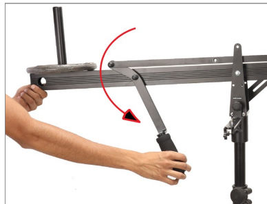
For Upper Angle

WARNING: When tilted manually, always maintain a control on the camera. The front heavy camera might move forward abruptly without notice, You need to be very careful at this point.