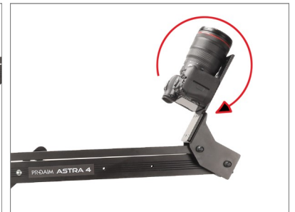
For Straight Angle