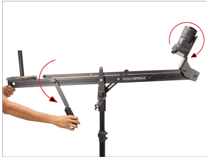
For Upper Angle

WARNING: When tilted manually, always maintain a control on the camera. The front heavy camera might move forward abruptly without notice, You need to be very careful at this point.