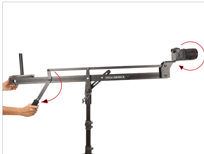
For Straight Angle