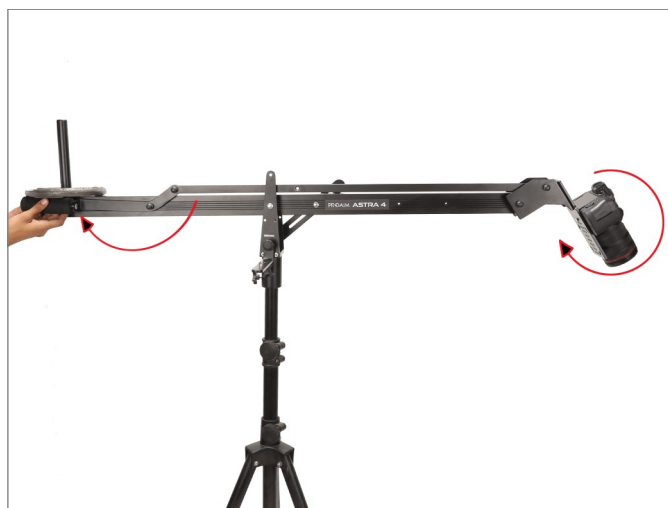
For lower Angle