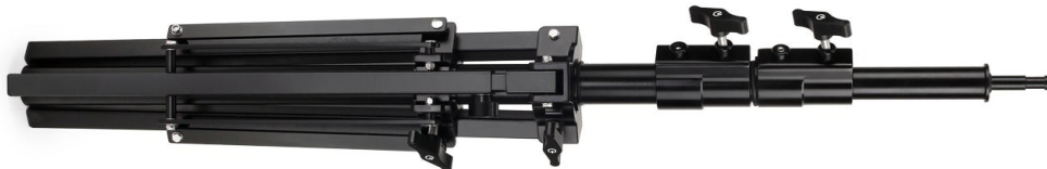
Alpha Docking Universal Support Stand with 5/8" Baby Pin Mount

Please inspect the contents of your shipped package to ensure you have received everything that is listed below.