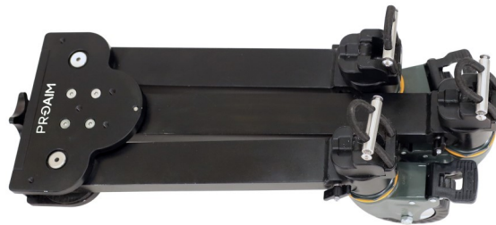
Proaim Agile Dolly

Please inspect the contents of your shipped package to ensure you have received everything that is listed below.