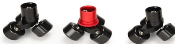
3 x Track Wheels