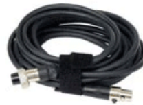
3 Meter Wire