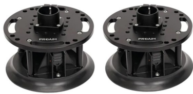
2x 8" Suction Cup

Please inspect the contents of your shipped package to ensure you have received everything that is listed below.