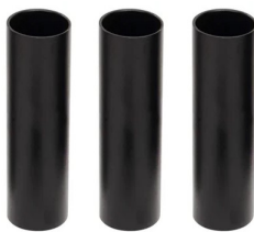
3 x 6" pipe with 48mm OD