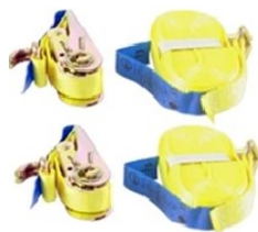
2x Safety Straps