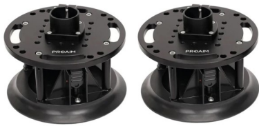
2x 8" Suction Cup

Please inspect the contents of your shipped package to ensure you have received everything that is listed below.