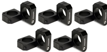
5 x 360° Rotating Speed Rail Clamp