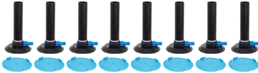
Suction cup with dust Covers