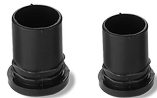
Bush (Size: 19mm, 16mm)