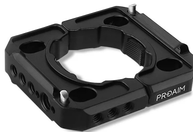
Mounting Clamp for DJI Ronin-S Gimbal