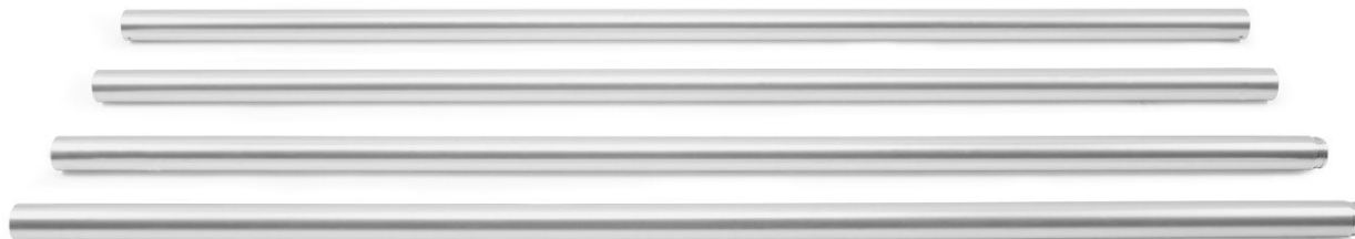
4x 4ft Portable Track Sections

Please inspect the contents of your shipped package to ensure you have received everything that is listed below.