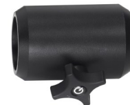
Counter Weight with flower Knob