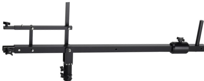
Vega Jib End Section